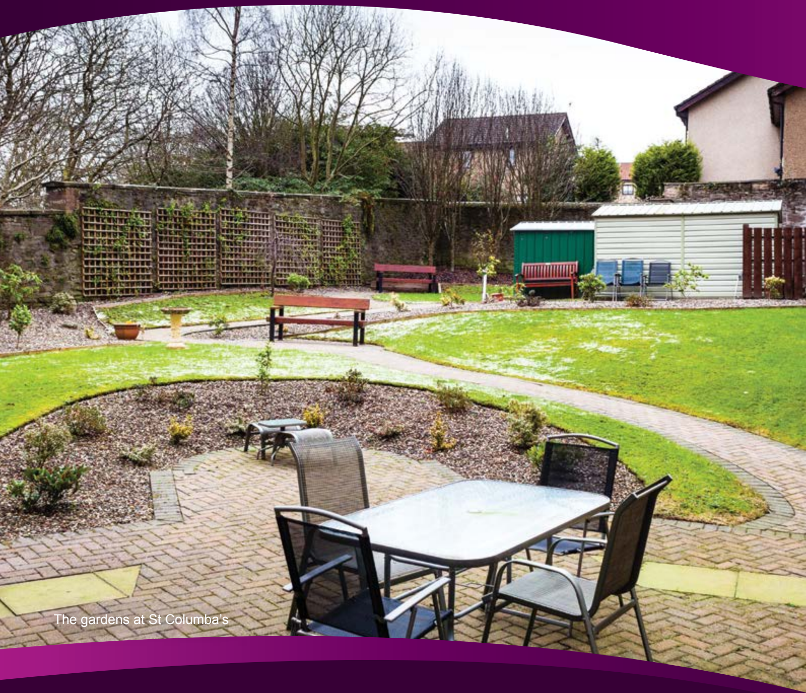
The gardens at St Columba's